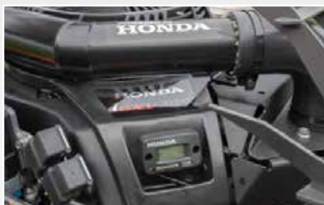
Electronic injection iGXV800 Stage V Honda engine