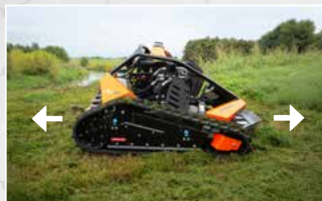
Bi-directional Cutting Capability