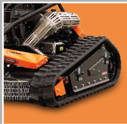
Standard Low-profile design for balanced performance