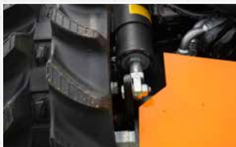
Electronic remote controlled cutting height for easy adjustments