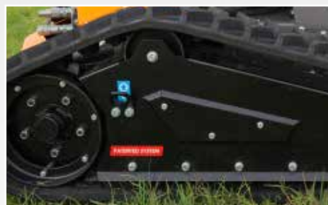
Patented system that prevents track derailment