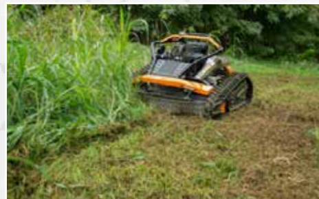
Bi-directional variable speed: 0–4.4 mph