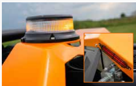
Warning and flashing lights