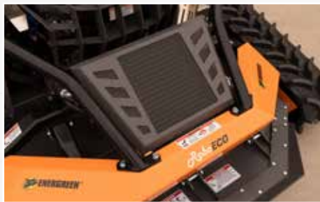
Automatic fan motion inversion for self-cleaning