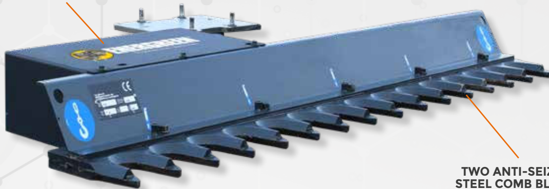
TWO ANTI-SEIZING STEEL COMB BLADES

POWER SHEARS is a professional branch cutting bar with automatic anti-seizing mechanism and high pressure valve. The bar is used for pruning hedges, shrubs and small plants up to a maximum diameter of 47". Power Shears features a robust steel frame with high wear resistance and two steel comb blades one of which is movable. They perform a precise and clean cut of the branch. It is available in two working lengths: 61" and 89". The tool is designed to be fitted, with professional hydraulic systems, to the arms of all Energreen ILF machines.