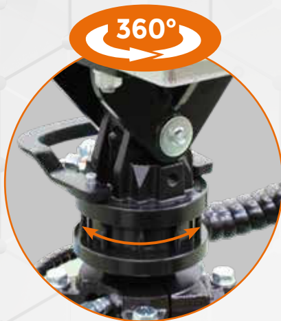
HYDRAULIC ROTATOR (OPTIONAL)