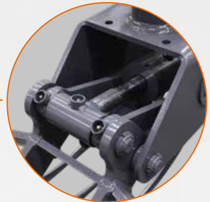
IDRAULICO HYDRAULIC JACK