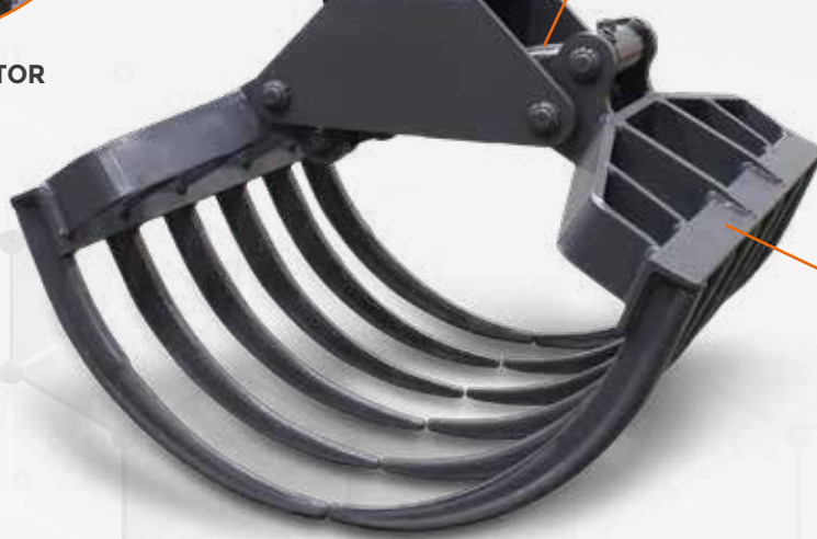
ENTIRELY BUILT IN STEEL

FORC-ONE is a clamp with horizontal cylinder for agricultural use and maintenance of green areas is suitable for the handling of manure, pruning, wooden branches and little logs. It has been designed with high yielding level pressed teeth which allow a fast and solid grip of the material.