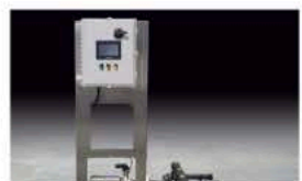
Continuum™ TF-XS Truck Fill Station