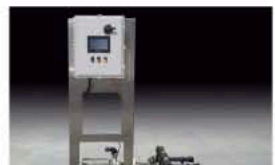
Continuum™ TF-S Truck Fill Station