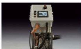
Continuum™ SC-100 Stand-Alone Controls