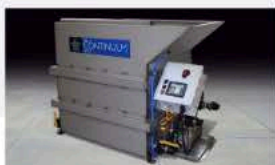
Continuum™ BM-3 Brine Maker