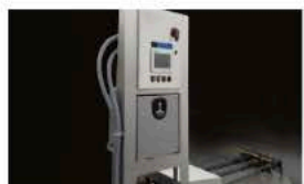
Continuum™ TF-XR Truck Fill Station