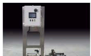
Continuum™ TF-XS Truck Fill Station