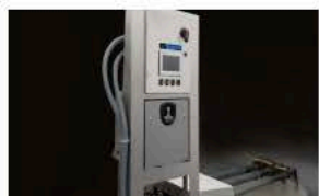
Continuum™ TF-XR Truck Fill Station