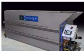
Continuum™ BM-6 Brine Maker