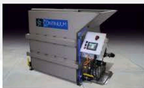
Continuum™ BM-3 Brine Maker