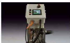
Continuum™ SC-100 Stand-Alone Controls