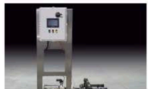
Continuum™ TF-S Truck Fill Station