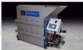
Continuum™ BM-3 Brine Maker