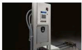
Continuum™ TF-XR Truck Fill Station