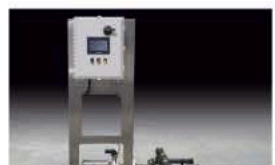
Continuum™ TF-XS Truck Fill Station