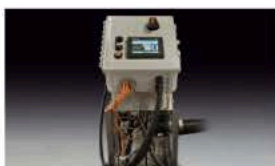
Continuum™ SC-100 Stand-Alone Controls