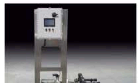
Continuum™ TF-S Truck Fill Station